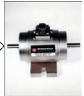
SensorData T231 Rotary Transformer Torque Sensor Note 5