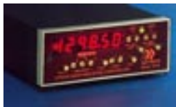
Daytronic 3X78 Carrier Instrument Note 4